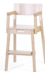
High children's chair 14 mini 50cm with armrest