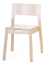
Children's chair 14 mini 38cm