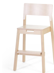
High children's chair 14 mini 50cm