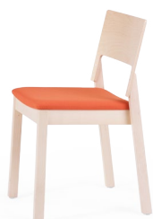
Chair 14, seat upholstered