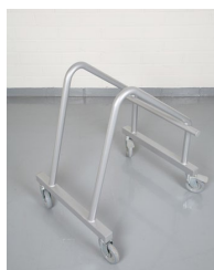
Trolley for chairs