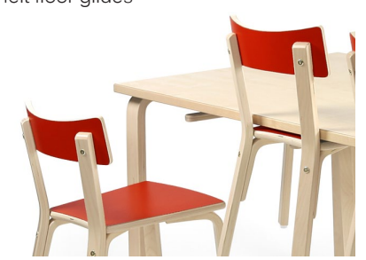
Hanger of chair under table-top