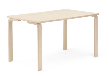
Table 120x60; 120x80 H72 cm, birch laminate