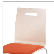
Chair with a hole in the backrest for a handgrip