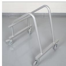
Trolley for chairs