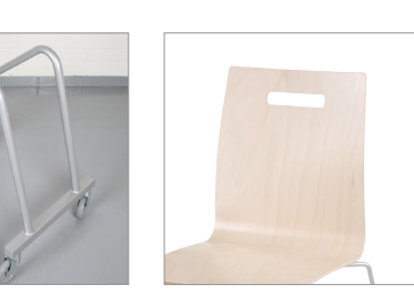
Chair 73 with hole in the backrest for a handgrip