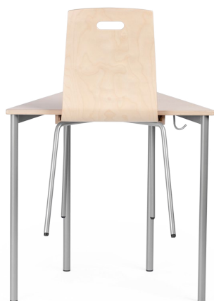
With hanger of a chair