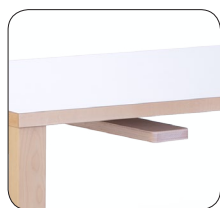
Hanger of chair under table-top