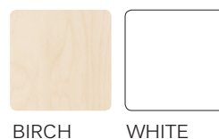
TABLE LEGS 60x30 mm bent birch plywood.