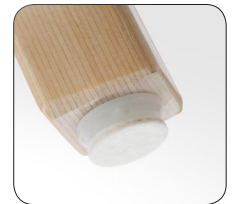
Felt floor glide

LAMINATE is a surface material which is used on furniture details that demand high resistance.