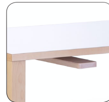
Hanger of chair under table-top