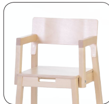
14 mini with armrest