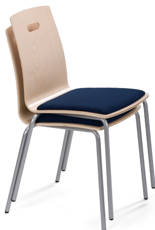
Stackable on floor max 5 chairs