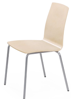
Chair 71 without handgrip