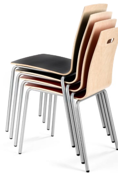
Stackable on floor max 5 chairs