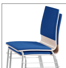
Stackable on floor max 4 chairs