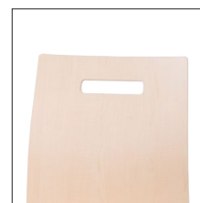
Hole for the handgrip on backrest