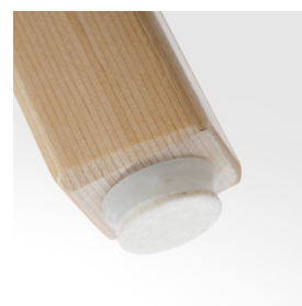
Felt floor glides