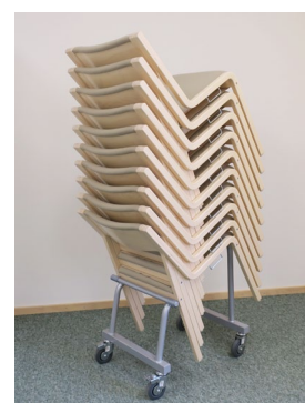
Trolley for chairs