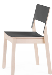
Chair 14 with laminate