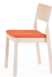
Chair 14, seat upholstered