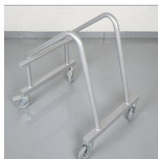
Trolley for chairs