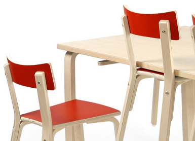
Hanger of chair under table-top