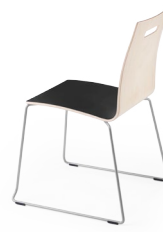
Chair 73 with laminate on one side, with hole for a handgrip