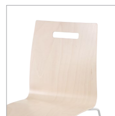
Chair 73 with hole in the backrest for a handgrip