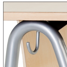
Hook for bag