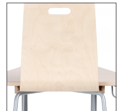
Chair-holder (applies for chair 76 only)