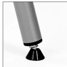
Adjustable floor glides