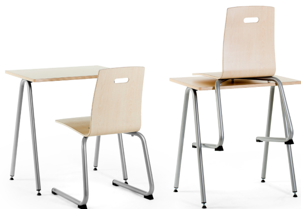
Match with student chair 72