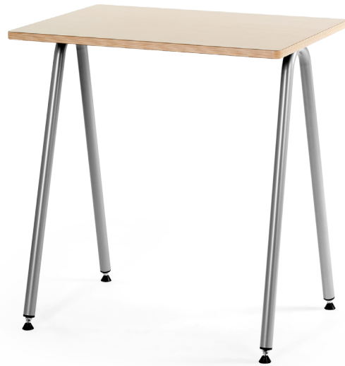
Table legs have adjustable floor glides to apply when avoiding swaying of the table on an irregular floor.

Ø 30 mm steel tube. Tubes wall thickness 2,5 mm. Powder painted RAL 9006.