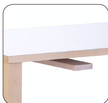
Hanger of chair under table-top