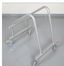
Trolley for chairs