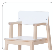
12 mini with armrest