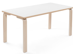
Table 120x60; 120x80 cm, height 46; 53; 59 or 64 cm

LAMINATE is a surface material which is used on furniture details that demand high resistance. Children's chair has laminated backrest and seat. It is possible to choose among birch imitation or colored laminate. Laminate is wearproof, durable to scratches and bumps. Surface is easy to clean. As laminate is sunfast, the colorful appearance of the chair stays changeless for years.