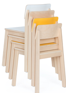
Stacked chairs use less space