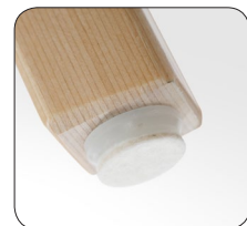
felt floor glide

LAMINATE is a surface material which is used on furniture details that demand high resistance.