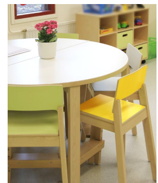
14 mini 50cm with laminate