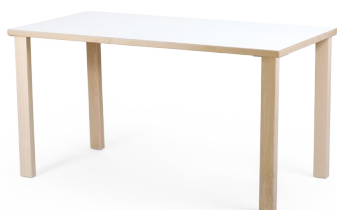
Table 120x60 H64; 59 cm, with solid wood legs