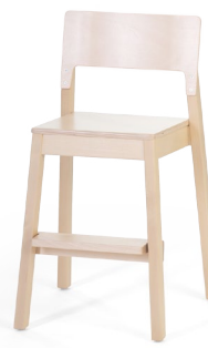
14 mini 50cm