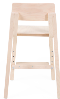
Height adjustable footrest 4 levels