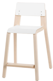
16 mini 50cm, with laminate