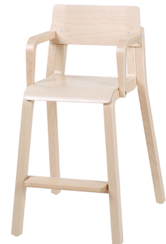
16 mini 50cm, with armrest Weight 4,4 kg