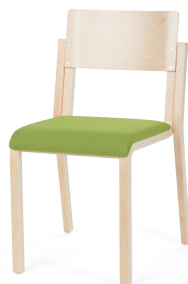
Adult chair 16, seat upholstered