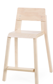
16 mini 50cm