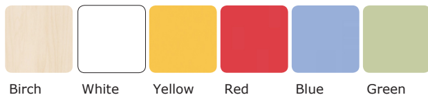
Birch White Yellow Red Blue Green

LAMINATE is a surface material which is used on furniture details that demand high resistance.