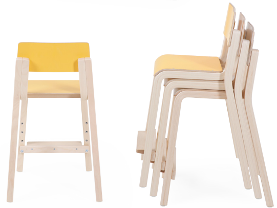
Height adjustable footrest 4 levels