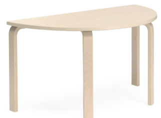
Semi-circle or trapezoid 120x60 H72 cm, birch laminate