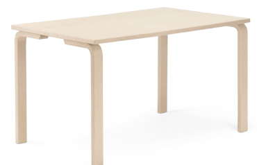
Tables 120x60 H72 cm, 120x80 H72 cm, birch laminate