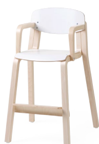
18 mini 50cm, with armrest, with laminate