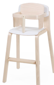
18 mini 52cm, with safety bar, with laminate