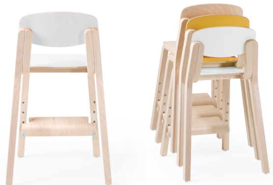
Height adjustable footrest 4 levels

Laminate is wearproof, durable to scratches and bumps. Surface is easy to clean. As laminate is sunfast, the colorful appearance of the chair stays changeless for years.