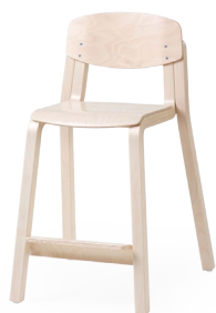
18 mini 50cm