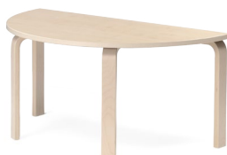
Semi-circular table 120x60 H64; 59 cm, birch laminate