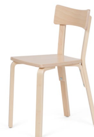
Chair 50 for adults