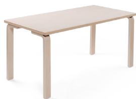
Children's table 120x60 H64; 59 cm, birch laminate