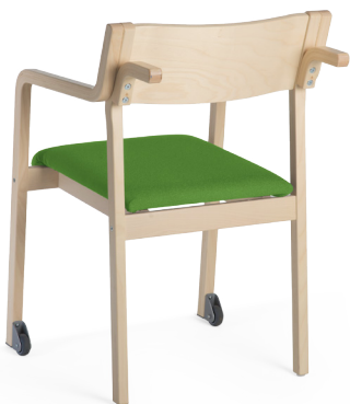
with handgrips and castors