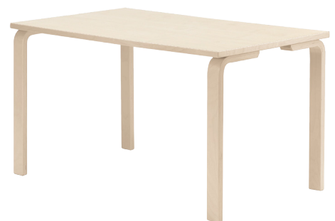
suitable TABLES with plywood legs 120x80 H72 cm 160x80 H72 cm