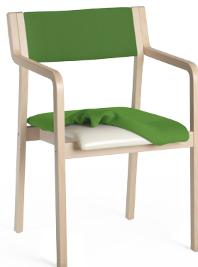
seat and backrest upholstered (backrest with non-removable cover)