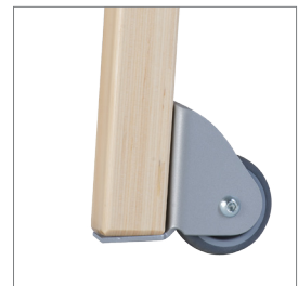
castors on front legs