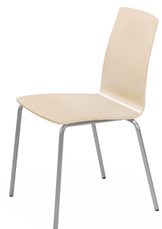
Chair 71 without handgrip