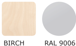
BIRCH RAL 9006